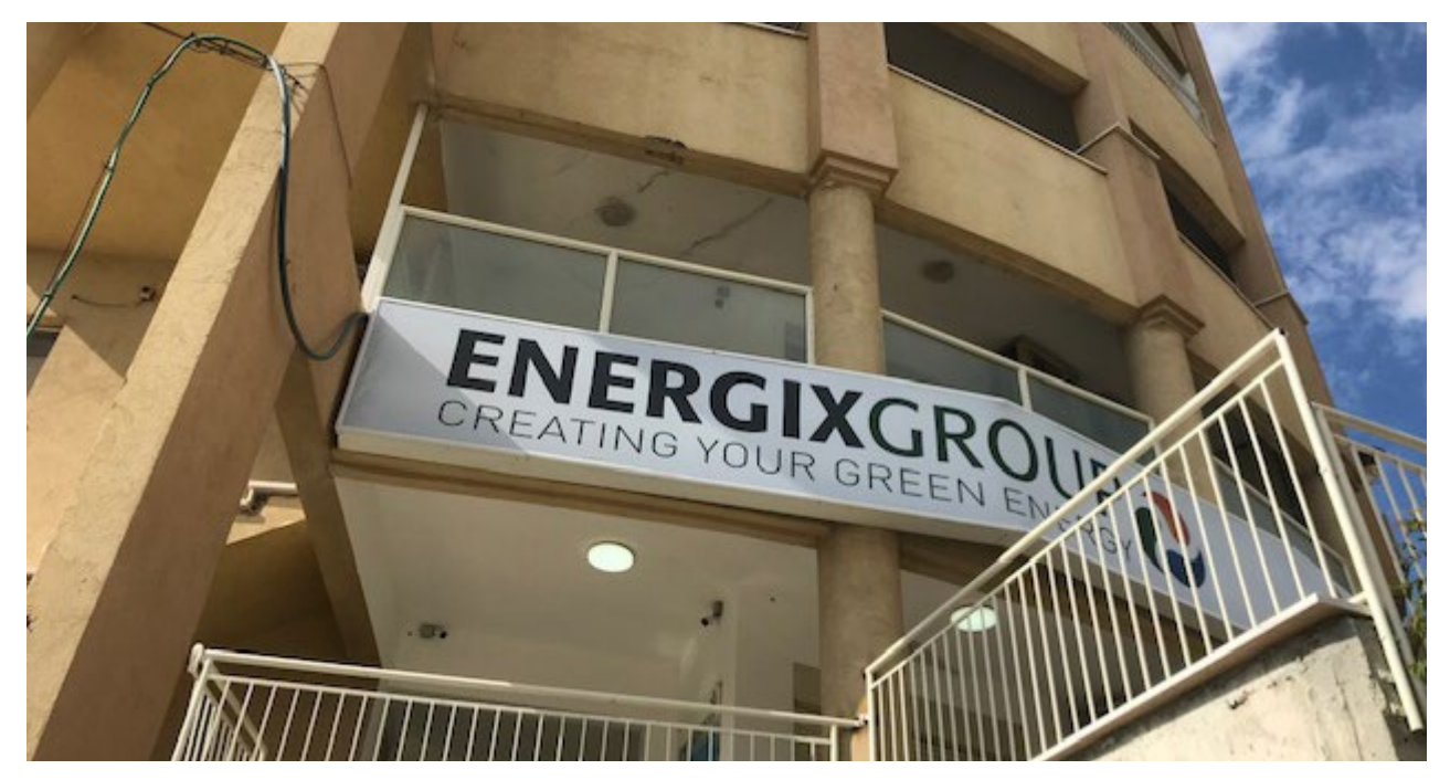
Energix Group offices in Majdal Shams, Occupied Syrian Golan.

South Har Hebron Limited Partnership (50.1%); Orlik (75%); Wintromill (100%); Caden Energix. Global presence: Poland, USA Head Office: 2 Jabotinsky St., Ramat Gan 5250501, Israel Tel: +972-3-5668855 Website: www.energix-group.com