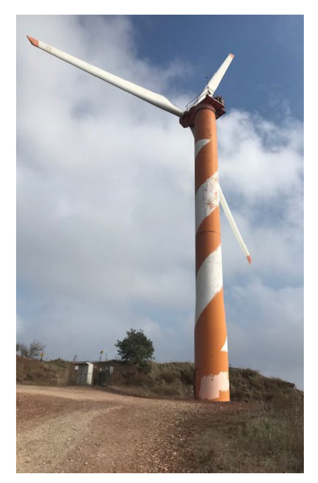
Al-A'saniya wind farm, Occupied Syrian Golan. November 2018

The fact that several of the wind farms, as well as their associated infrastructure, have been classified as national infrastructure, makes clear that they are primarily intended to benefit the Israeli economy and population. As noted in a meeting of the North District's Regional Committee for Planning and Construction regarding NIP 62/\varkappa , the wind