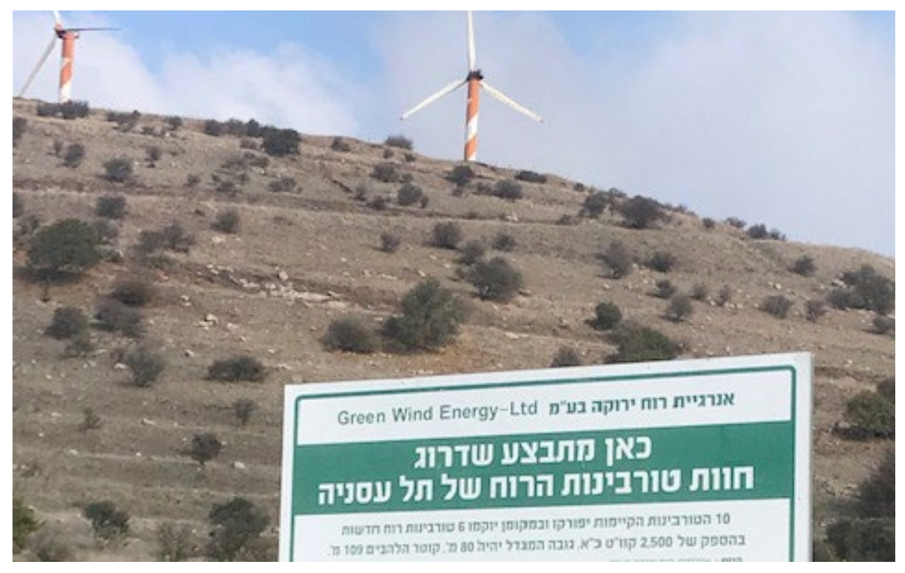
Project sign near Al-A'saniya wind farm, Occupied Syrian Golan. November 2018

The Israeli military will have the ability to directly control the operation of the turbines through a switch located in the air force control center.