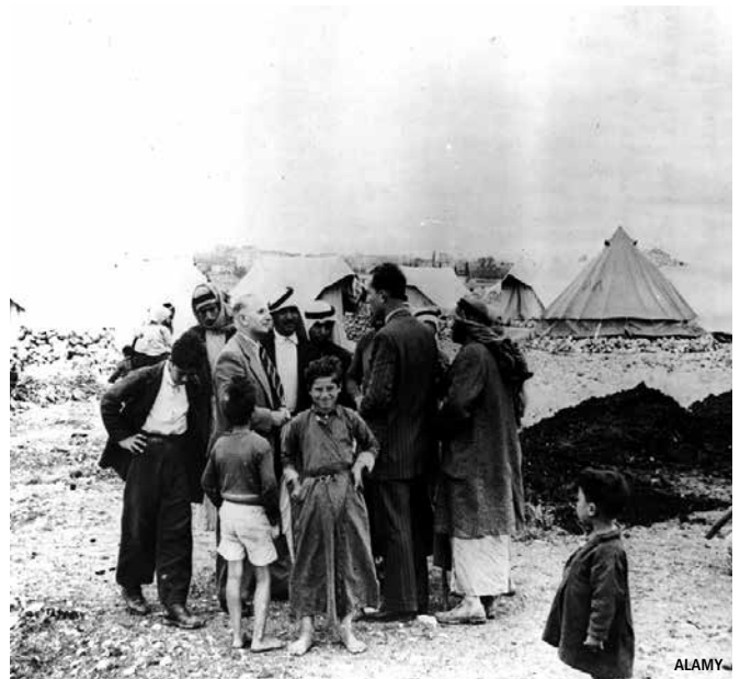
South Shore Camp, Transjordan, 1948

Initially envisaged to provide short-term humanitarian assistance to Palestinian refugees, UNRWA's work has now been operating for 68 years, with its mandate repeatedly renewed by the UN General Assembly. UNRWA has a core operating budget of approximately US$760 million, 35 in addition to emergency appeals to respond to the humanitarian crises in Syria (US$411 million) 36 and the oPt (US$402 million) 37 . In recent years UNRWA has been consistently running a core budget deficit of around US$77m and these emergency appeals remain severely under-funded, severely limiting the support it is able to provide. 38 This funding crisis has been severely exacerbated by the US Government's decision in January 2018 to cut its funding for UNRWA by half. 39