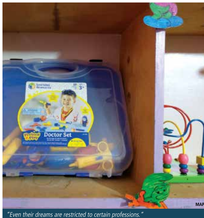
“Even their dreams are restricted to certain professions.”

Beyond the individual right to work of Palestinian health workers, these combined factors mean that the development of a Palestinian health workforce in Lebanon has been severely limited. The potential for Palestinian health workers to legally contribute to the Lebanese health system is also reduced. For example, although the President of the Order of Nurses has identified a chronic shortage of nurses in Lebanon, 120 the legal and bureaucratic barriers to legal practice for Palestinian nurses have not been fully resolved.