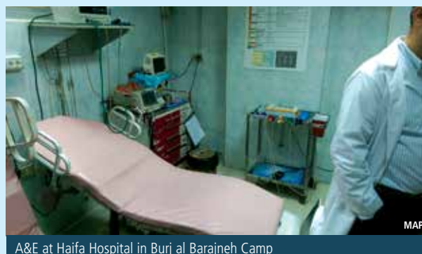
A&E at Haifa Hospital in Burj al Barajneh Camp

The salaries at PRCS are very low for all employees. Palestinian nurses in general are paid very low salaries in Lebanon except for those who have advanced degrees or qualifications. Sometimes, very good and highly qualified doctors come to work at PRCS, but they leave and go to work elsewhere because of the low pay. Lebanese doctors and nurses working in governmental or Lebanese private hospitals are paid much higher salaries."