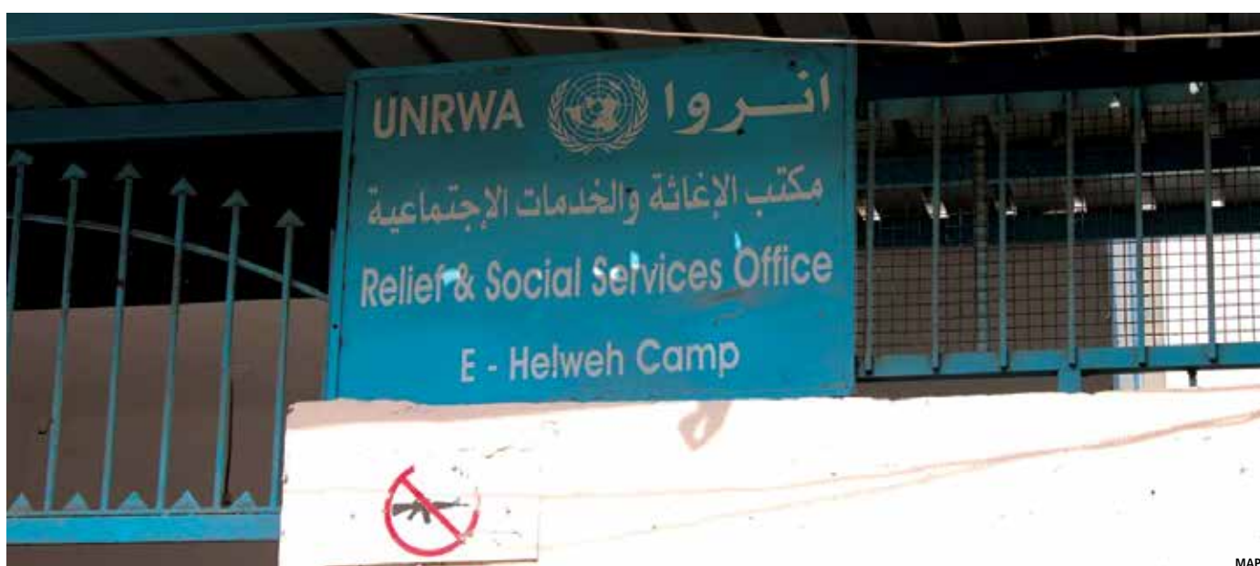
Restrictions to the right to work increase aid dependency

Imaan*, a Palestinian doctor working both in an NGO clinic in a Palestinian refugee camp and a private Lebanese hospital