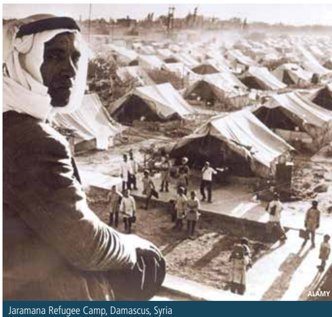
Jaramana Refugee Camp, Damascus, Syria

Bedouin refugees displaced from the Naqab (or Negev) desert during and after 1948 face particular threats to their right to health. Many resettled in what is now classified as “Area C”, which constitutes 60% of the West Bank, where Israel maintains full civil and military control. There they face restricted movement due to settlements, closed military zones and checkpoints, as well as regular Israeli demolitions of homes and other structures. As they are prevented by Israel from building permanent health infrastructure such as clinics, they are reliant on visits from mobile health clinics such as that provided by MAP for primary healthcare. 18 The UN has identified 7,000 Bedouin living in the East Jerusalem periphery, 70% of whom are refugees and are at risk of forcible transfer amid the coercive environment created by Israel. 19