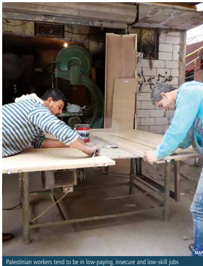
Palestinian workers tend to be in low-paying, insecure and low-skill jobs

“[UNRWA] have always been advocating for the right to work and will continue to do so with the Lebanese government. We also call on our donor partners to advocate too because this is a basic human right without which refugees cannot live in dignity. The Lebanese parties unanimously agreed in their unified vision on easing restrictions on the right to work but this is yet to be endorsed by the Cabinet and implement it. We look forward to working with the Lebanese authorities, business people and others to pursue the implementation of this right and the elimination of all forms of discrimination in Lebanon.” 94