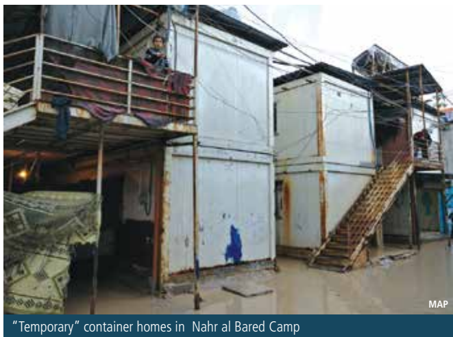
"Temporary" container homes in Nahr al Bared Camp

The restrictions and bureaucratic barriers to Palestinian refugees' right to work contributes to their marginalisation and exploitation in Lebanon. In 2015, UNRWA and researchers from the American University of Beirut (AUB) estimated the rate of unemployment among Palestinian refugees from Lebanon to be 23% (31% among women), and 52.5% (68% for women) among Palestinian refugees who have arrived in Lebanon from the conflict in Syria. 100