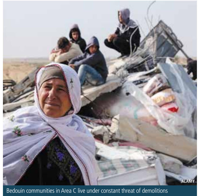
Bedouin communities in Area C live under constant threat of demolitions

Gaza is one of the most densely populated places in the world, with overcrowding particularly acute in its eight refugee camps. 20 Israel has imposed a tightened blockade and illegal closure on Gaza since 2007, which, in combination with three large-scale Israeli military offensives between 2008 and 2014, has led to the de-development of Gaza's economy and vital infrastructure including healthcare. In 2017, only 54% of exit permits for patients seeking treatment elsewhere in the oPt or abroad were granted by Israel and a record-high number of such patients died. 21 Health professionals are frequently prevented from exiting for professional development opportunities outside Gaza. Shortages of essential medicines are common, 80% of Palestinians in Gaza are now dependent on some form international aid, and nearly one million rely on UNRWA for food aid. 22 The UN has reported that on its current trajectory, Gaza will become “unliveable” by 2020. 23