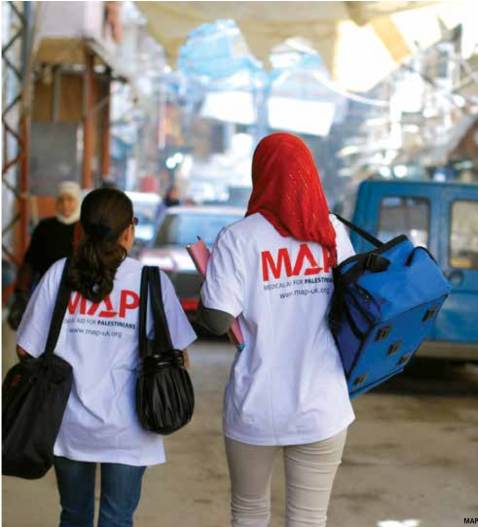
Midwives walking between home visits in Lebanon

MAP works for the health and dignity of Palestinians living under occupation and as refugees.