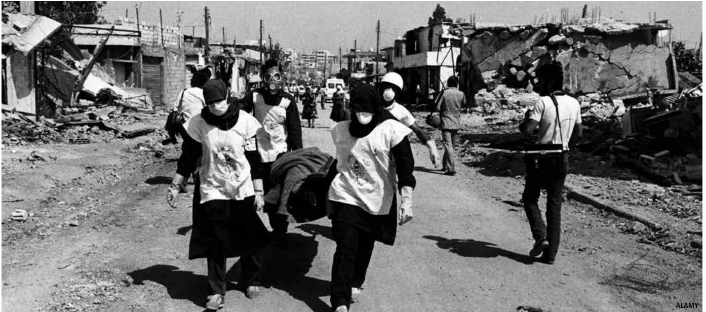
United Nations relief at Shatila refugee camp, 1982