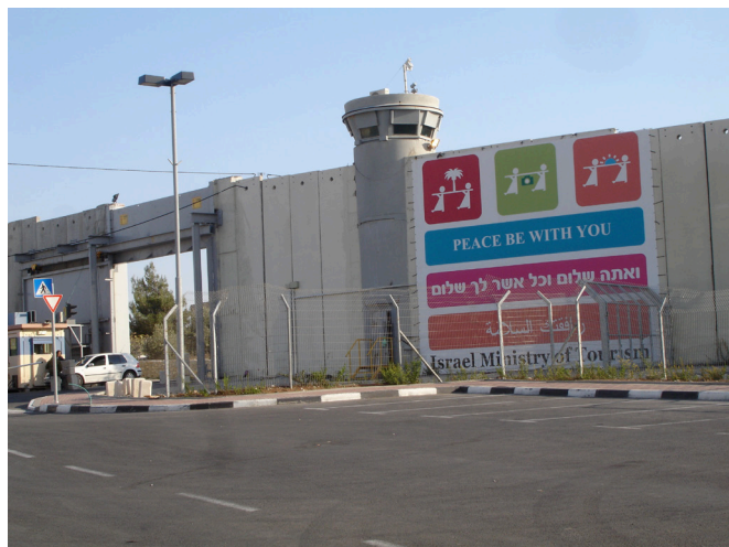
Figure 2 Illustration of Bethlehem checkpoint.

to trauma and violence was very high. The experience of the teenagers was horrific: 80% had seen shootings, 28% had seen a stranger killed, 11% had seen a friend or neighbour killed and 54% of boys had experienced body searches. Not surprisingly, 10.4% of the participants had a depressive-like state, 14.1% emotional difficulties and 10.3% somatic disorders.