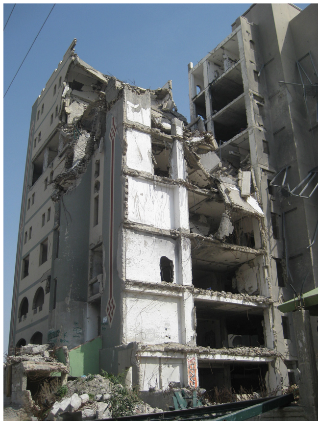
Figure 3 Illustration of destruction in Gaza

The accident mortality in children under 14 years in 2009 was 12.1 per 100 000. Shaheen showed that the leading