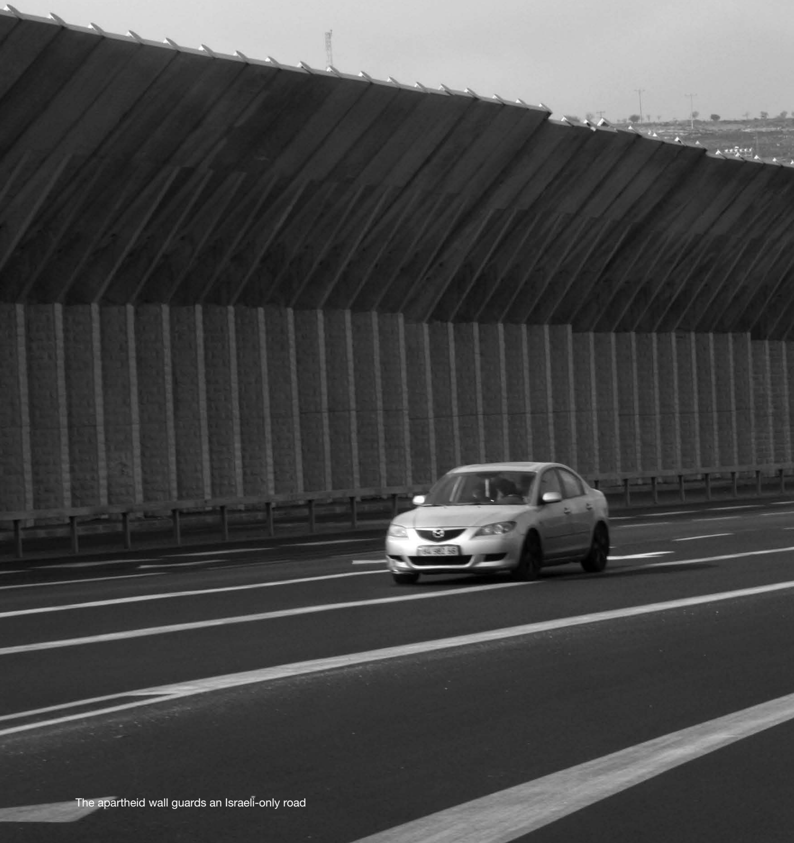
The apartheid wall guards an Israeli-only road

‘ We accept the state of Israel, why do they not accept us? ’