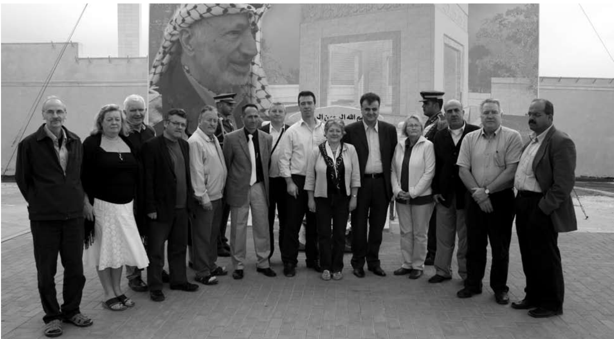
Laying a wreath at the tomb of President Arafat