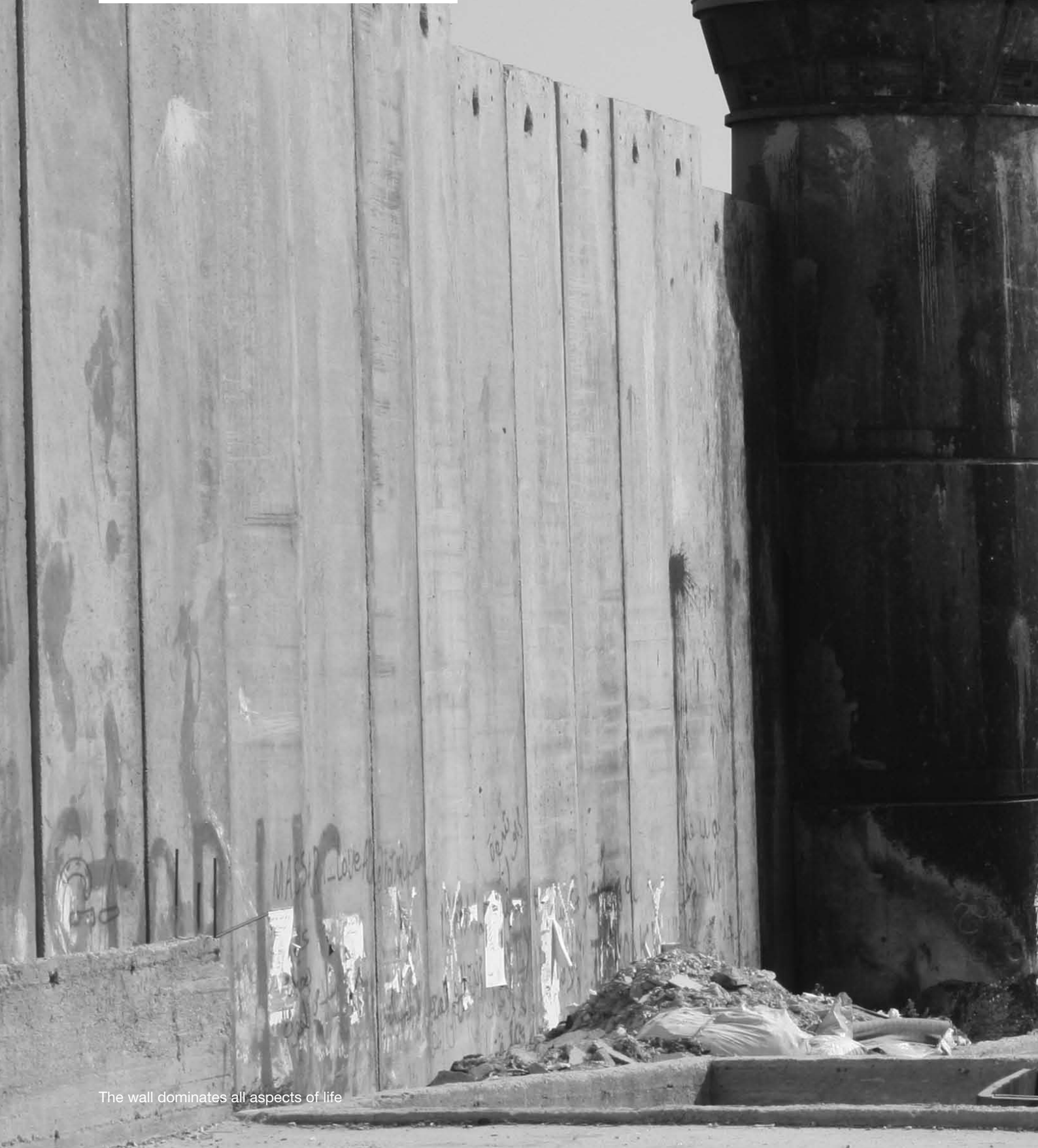
The wall dominates all aspects of life

‘ This huge wall separates the local Arab population from their mosque on the other side... clearly visible to us all ’