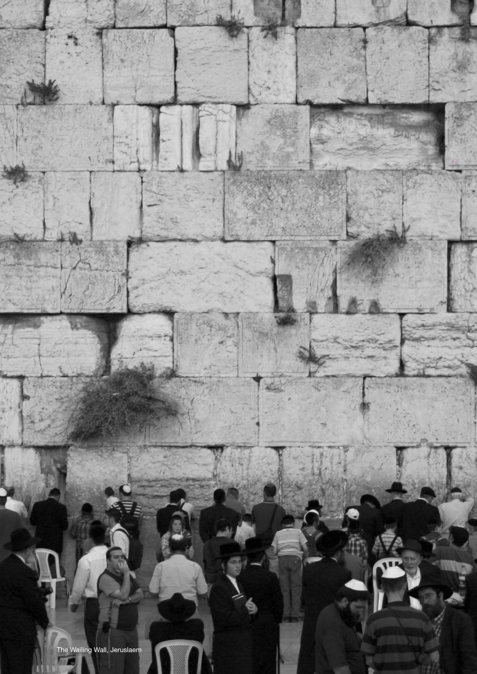
The Wailing Wall, Jerusalem