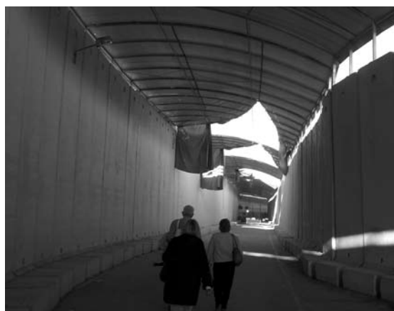
Israeli security corridor at Gaza