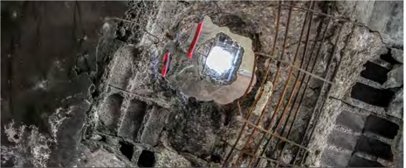
Entry point for one of the shells that hit the Mebarret Al Rahma Centre for People with Disabilities