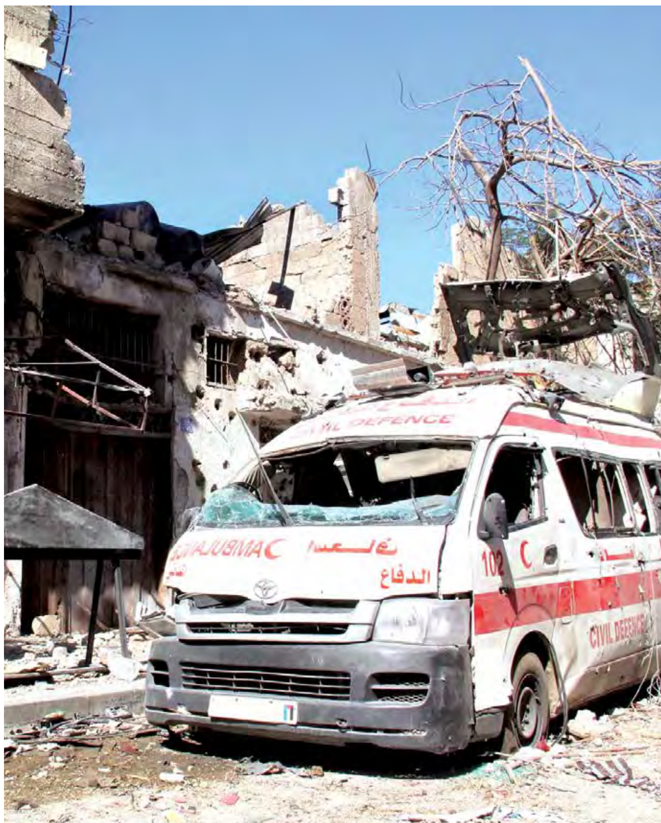
A destroyed ambulance in Shujaiyya