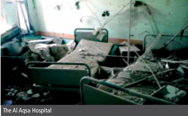
The Al Aqsa Hospital

The 100 bed Al Aqsa Hospital, located in the town of Deir Al Balah, is the main casualty hospital in the Middle Area district of Gaza and also served as a place of shelter for many families during the early weeks of the attacks as they sought to escape the bombardment.