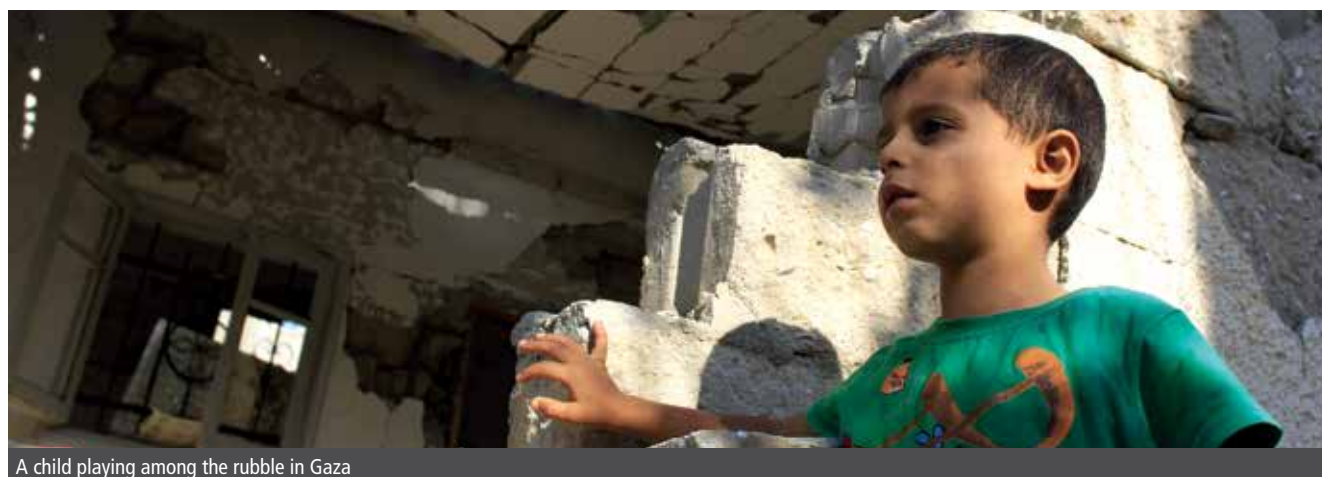
A child playing among the rubble in Gaza

The large-scale military offensive in 2014, with its devastating consequences for the civilian population and civilian infrastructure, was the latest in what are now periodic military operations on Gaza. Since 2000, 7,303 Palestinians have been killed by the Israeli military across Gaza, of which 2,232 were women and children. 45 More Palestinians were killed in 2014 than in any year since 1967. 46 In the aftermath of the 2008/09 attacks of "Operation: Cast Lead", the UN established a Fact Finding Mission, which later produced the Goldstone Report. 47 However the international community has failed to ensure accountability for the 2008/09 attacks or address the root causes of the continued conflict. The effects of impunity for these attacks are highlighted in the incidents in this report. The international response to the Commission of Inquiry into the 2014 Gaza Conflict must finally put an end to impunity for attacks on civilians, medical facilities and medical personnel in order to deter recurrence of these attacks in the future.