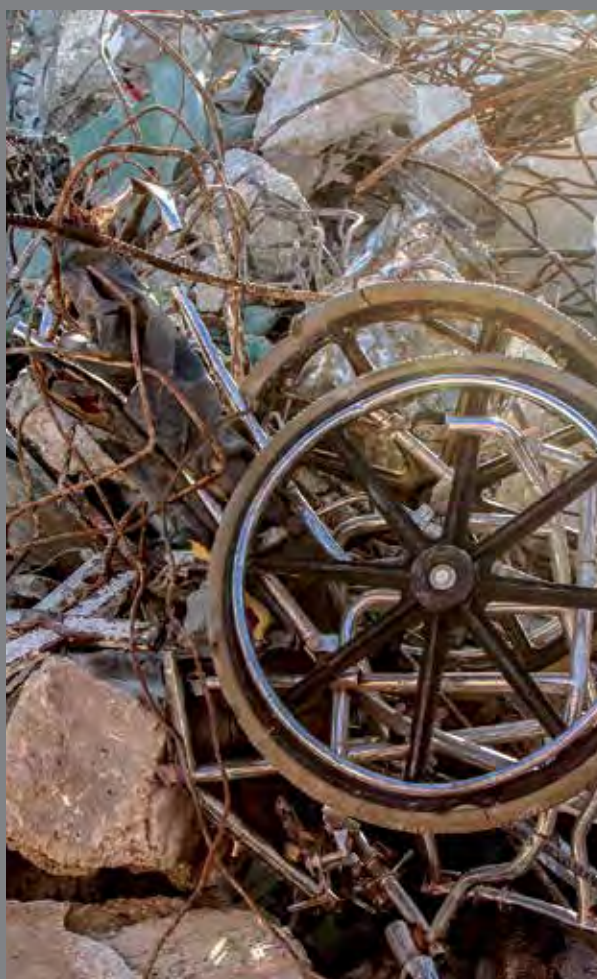
A wheelchair in rubble

An hour later, one of the nurses of the hospital informed me that the hospital was bombed again by the Israeli military. This missile was fired without any warning from the Israeli military. I called the ICRC again and told them that shelling of the hospital is being repeated, and asked them again for their intervention to stop the aggression on the hospital. At approximately 20:45 on Thursday 17 July 2014, I received a call from one colleague informing me that the hospital was being exposed to constant shelling which led to a power cut and fires on the second, third and fourth floors. I asked my colleagues who were in the hospital to evacuate the patients from the hospital. They evacuated the patients under a constant shelling in the dark."