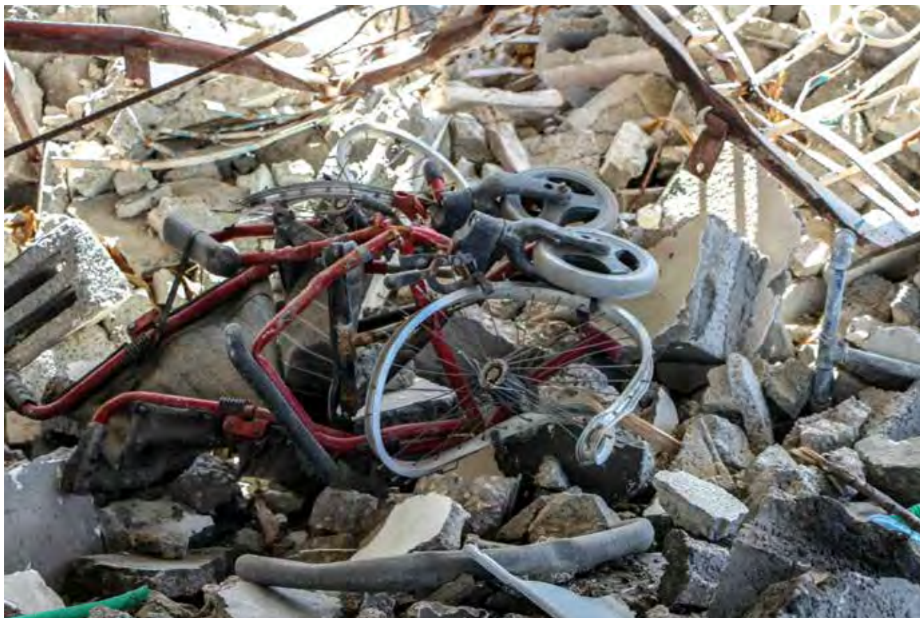
A wheelchair in the ruins of the Mebarret Al Rahma Centre

The Mebarret Al Rahma Centre for People with Disabilities was established in 1994 to provide essential services to Palestinians living with disabilities in Gaza. At the start of the Israeli military operation there were nineteen people living at the centre. However, at the time of the attack on the 12 th July 2014, fourteen of the residents had gone away for the weekend.