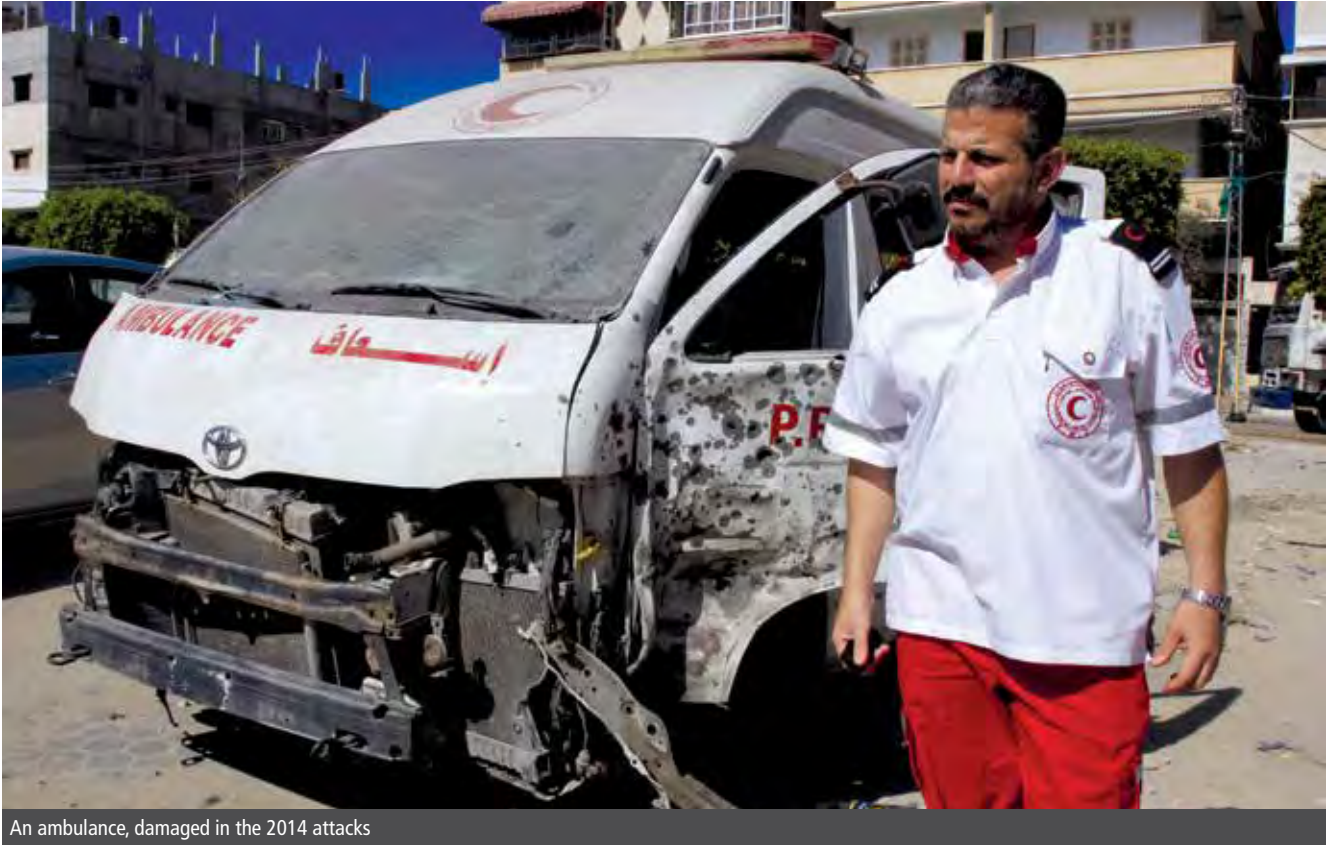
An ambulance, damaged in the 2014 attacks