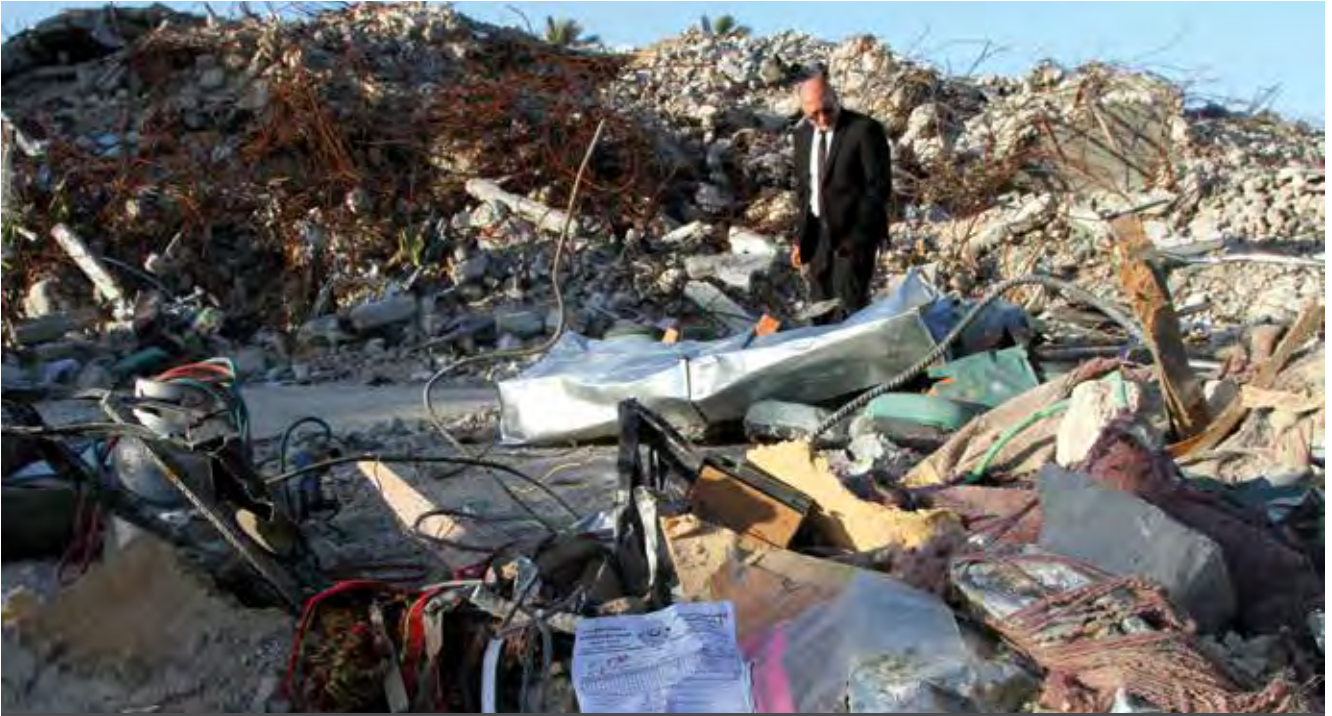
The ruins of Al Wafa, Gaza's only rehabilitation hospital