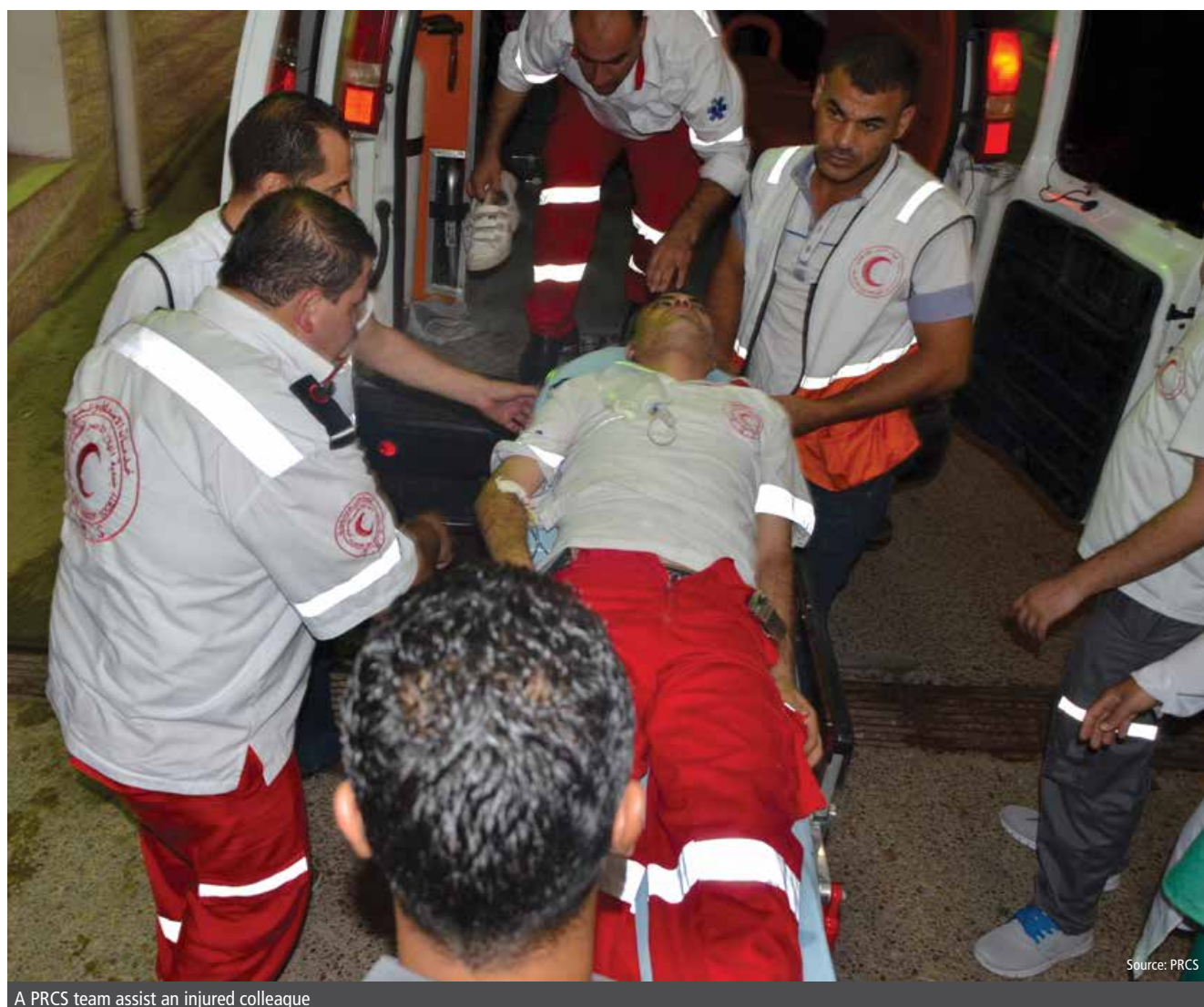
A PRCS team assist an injured colleague