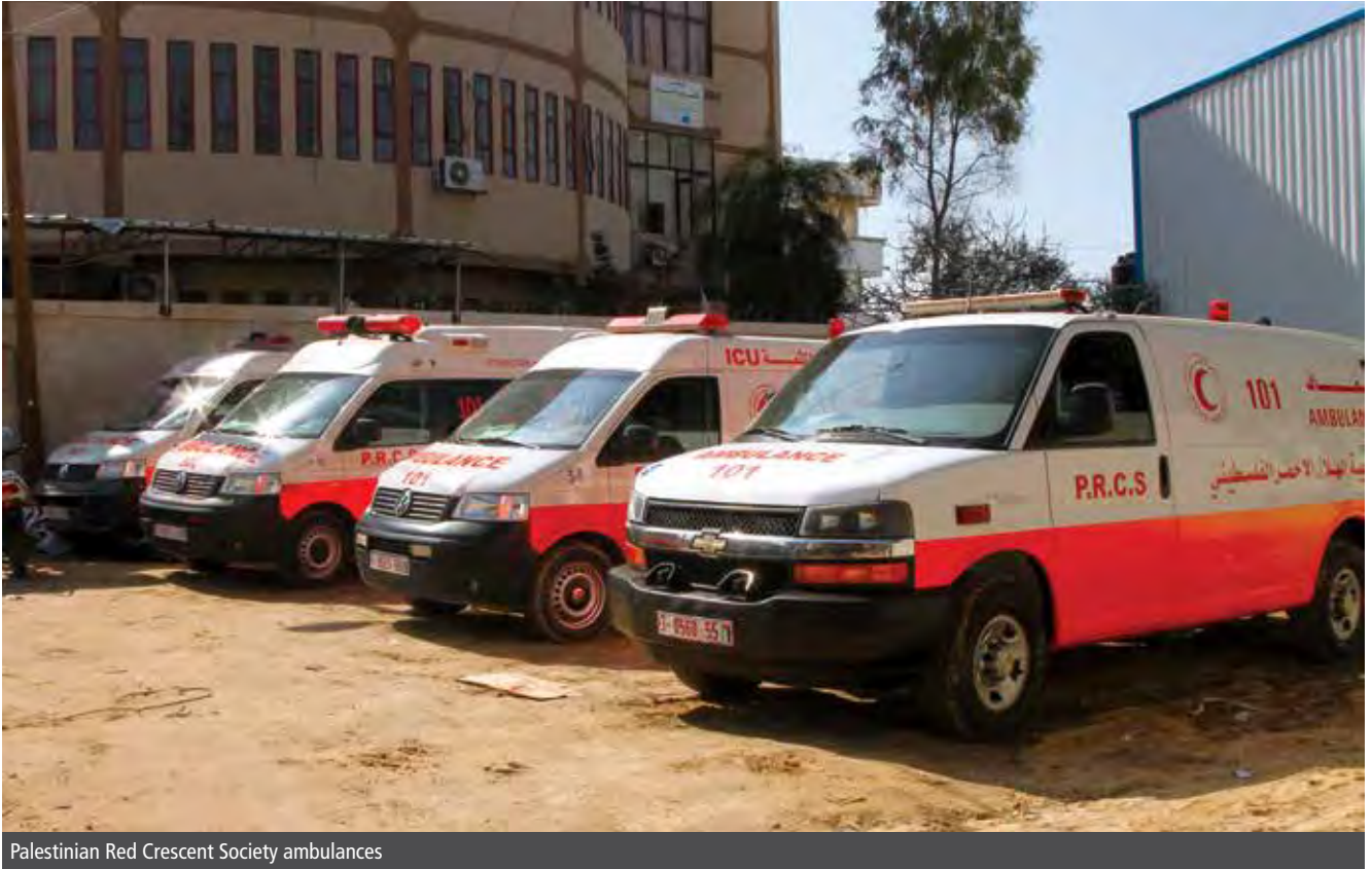
Palestinian Red Crescent Society ambulances