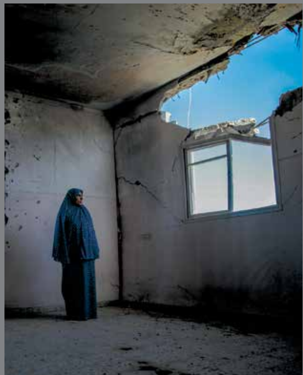
A woman standing in her damaged house, next to the Al Aqsa hospital