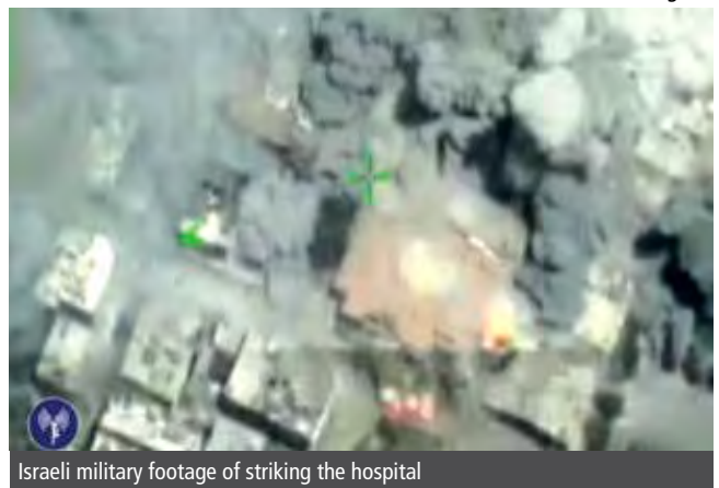
Israeli military footage of striking the hospital

"Since there is no guarantee for safety in the future, we decided to move the location of the hospital from near the Israeli border to a safer place in the middle of the city."