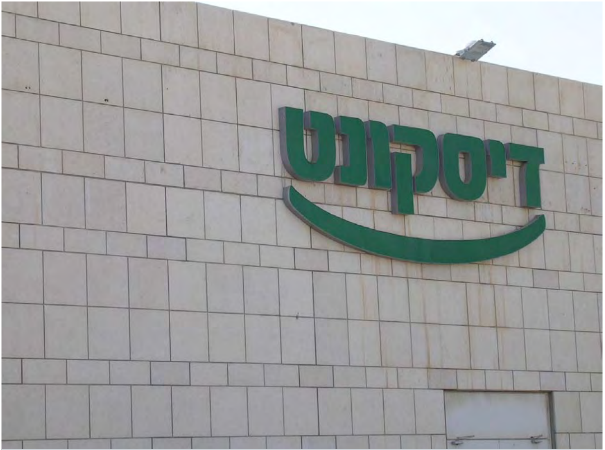
The sign of Bank Discount in the settlement of Ma'ale Adumim