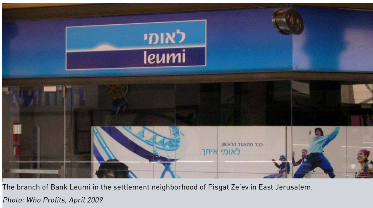
The branch of Bank Leumi in the settlement neighborhood of Pisgat Ze'ev in East Jerusalem.