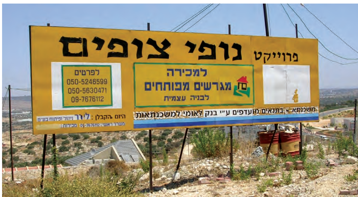
An advertisement for a construction project called Zufin View in the settlement of Zufin. In the bottom it says: "Mortgages in preferential conditions by Leumi Mortgage Bank".