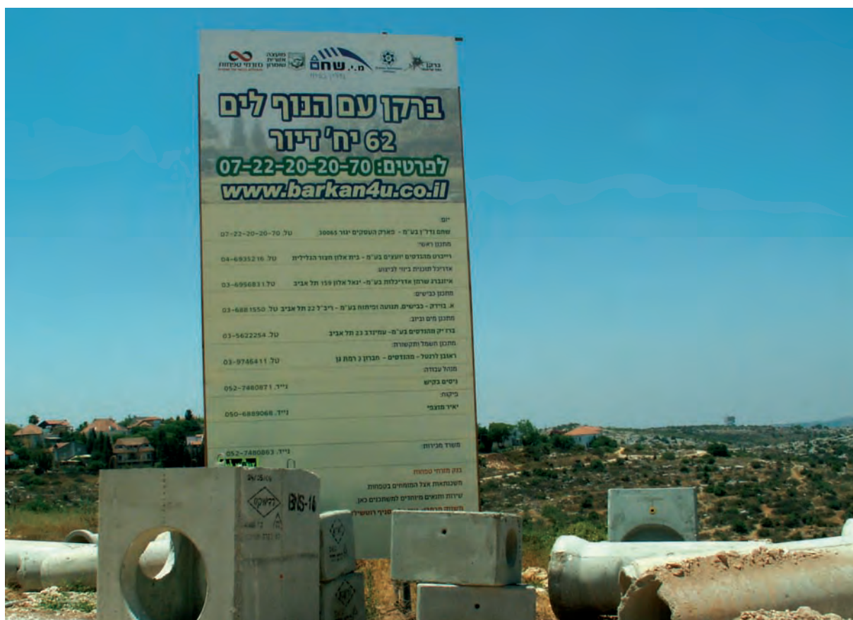
A sign advertising the construction of a new neighborhood in the settlement of Barkan (64 housing units). The logo of Mizrahi Tefahot Bank appears on the top left corner of the sign and at the very bottom of the sign it says: "Mizrahi Tefahot Bank, Mortgages available from the experts of Tefahot, home-buyers here get preferential conditions and service."

There are six Israeli banks that offer mortgage loans for homebuyers, and these make up all of the major Israeli commercial banks: Bank Hapoalim, Leumi Mortgage Bank (of Bank Leumi),