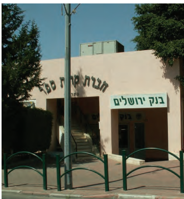
The branch of Jerusalem Bank in the settlement of Modi'in Illit.