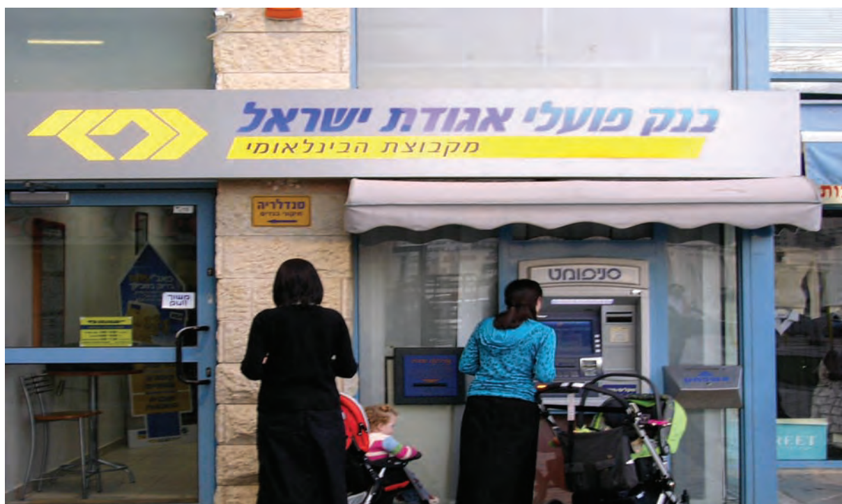
The branch of Bank Poalei Agudat Israel of First International Bank in the settlement of Modi'in Illit Photo: Who Profits, April 2009.

power to occupied land (a specific violation of international law), and its sustainment. Furthermore, real estate in Israeli settlements is used in these instances by banks as collateral for the loans. Thus, through these loans banks become stakeholders in a settlement real estate and, in cases of foreclosure, the bank may end up fully owning that property.