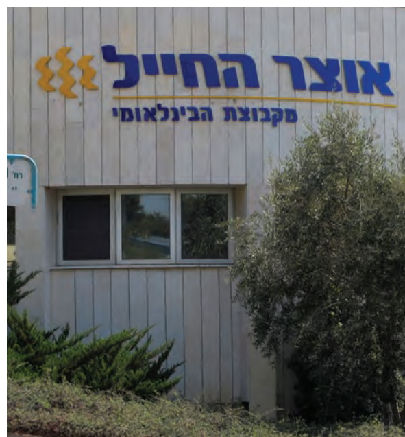
The branch of Bank Otzar HaHayal Israel of First International Bank in the settlement of Ariel.