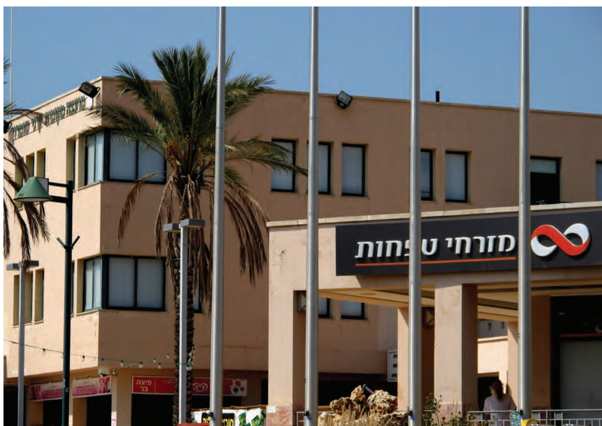
A branch of Mizrahi Tefahot Bank in the settlement of Karney Shomron.

All of the major commercial banks in Israel have branches on occupied land, either their own branches or branches of banks in which they are the controlling shareholders. The Bank of Israel publishes a frequently updated list of branches on its website, detailing their affiliation and location. In total, 34 Israeli branches are located in settlements. 6 These branches offer their customers all of the services that any of the other branches of these banks offer, including