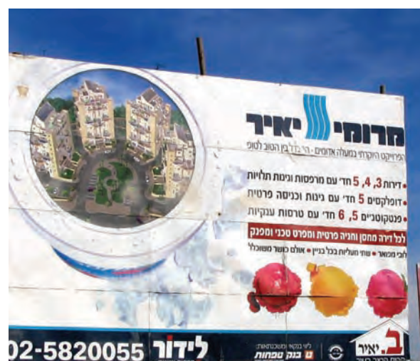
An advertisement for a construction project called Yair Heights in the settlement of Ma'ale Adumim. In the bottom it says: “Bank accompaniment and mortgages: Bank Tefahot”.

an accompaniment agreement deeply implicates the bank in the construction project; in a sense, the bank has taken on itself a form of partnership with the construction company for the purpose of completing the particular construction project. In case the project goes bankrupt, the bank becomes the owner of the property, responsible to the apartment buyers.